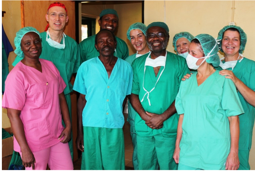
Medical Team at Remera-Rukoma and Nyamata Hospital with the First Patient who underwent hernia operation under Local Anaesthetic